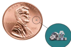
Figure 1 – iStent inject W compared to a penny

These 2 stents are preloaded into a custom injector, which is the instrument your surgeon uses to implant the stents in your eye. During implant surgery, the 2 stents will be placed closely together to help reduce eye pressure.